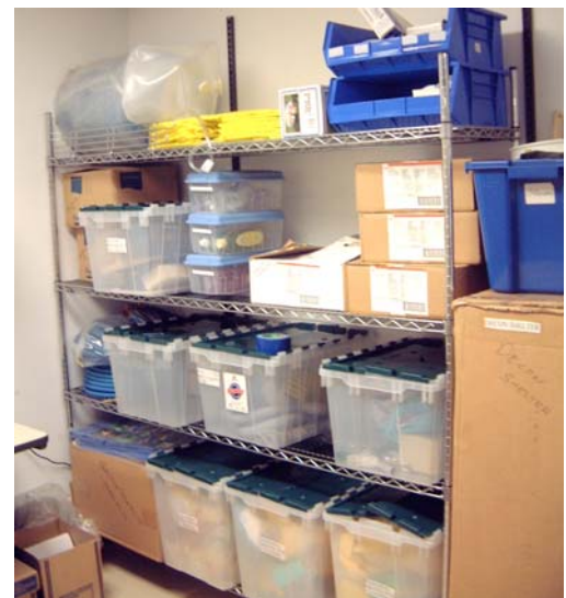
A storage room near the ED door offers convenient access for first receivers' supplies.