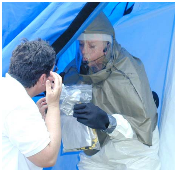
Put victim's personal items in a labeled plastic zip bag.