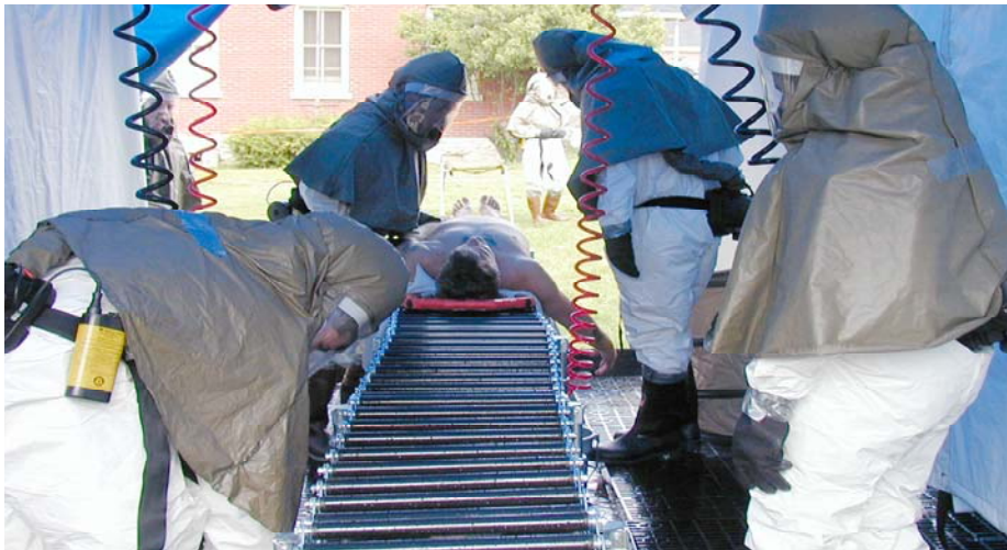
A roller system platform helps move non-ambulatory victims on backboards through the decontamination facility.

Because of the time it takes first receivers to put on PPE and to set up decontamination facilities, hospitals may want to consider arranging for alternate rapid forms of decontamination until more sophisticated decontamination facilities are up and running. For example, some hospitals use high capacity, low-pressure hoses or showerheads, connected to high capacity, temperature-controlled water sources. These hoses and showers allow rapid preliminary drenching of multiple victims. Where multiple shower heads can be activated, ensure that the available water flow into, and through, the system is adequate to provide rapid decontamination at each shower head. 68