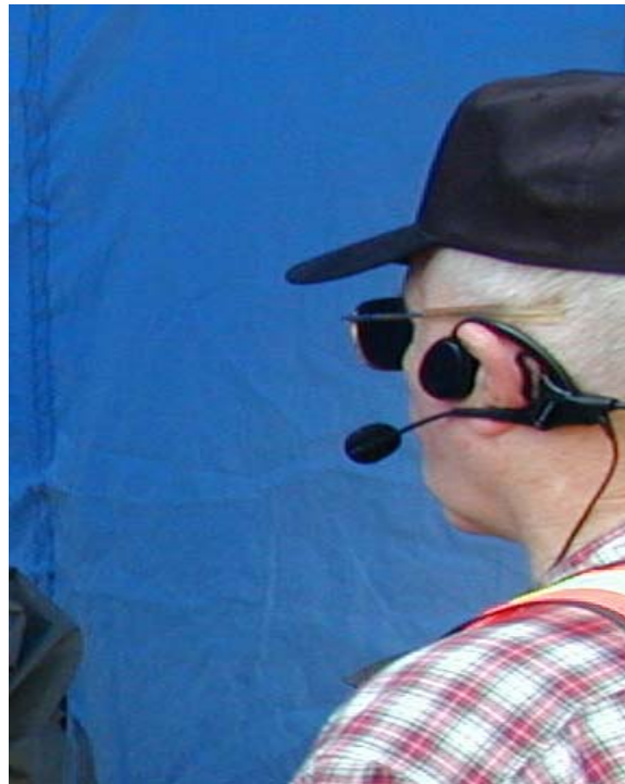
Detail of “temple-transducer” style radio headset.