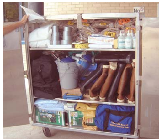
Staff can quickly move wheeled equipment carts from storage to the staging area.

Long-term maintenance of battery-powered respirators, such as PAPRs, creates a special challenge. The