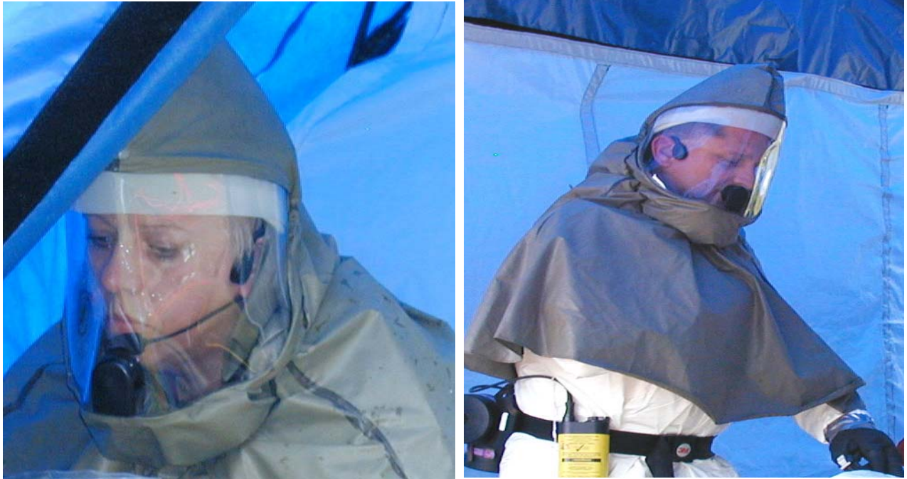
“Temple-transducer” style two-way radio headset stays in place under PAPR hoods.