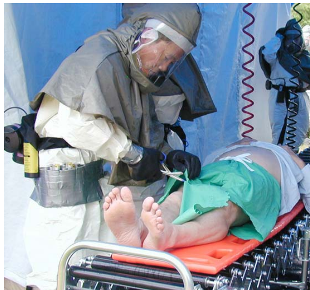
Use blunt scissors to cut away clothing. Avoid stretching or wringing cloth.

Non-ambulatory victims can require a substantial proportion of first receivers time and efforts. First receivers are likely to experience the greatest exposures while assisting these victims. Staff should take steps to identify possible sources of contamination and limit their exposure to those sources. For example, Hospital A uses specific procedures for removing victims clothing to minimize first receiver and victim exposures. Assistants use blunt-nose scissors to cut away clothing, rather than pulling it off. Tugging on clothing can produce a wringing action that might distribute contaminant on the victim, healthcare workers, and the surrounding area. Once removed, the clothing is immediately placed into a sealed container.