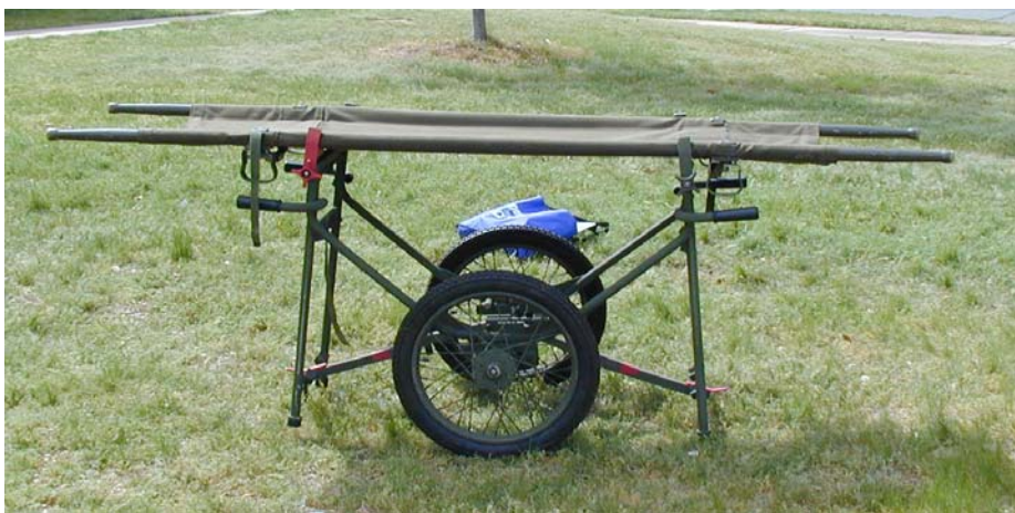
Hospitals can obtain military surplus equipment to supplement the decontamination facility supplies. (Shown here: a field stretcher for transferring non-ambulatory victims from arriving vehicles to the decontamination facility.)