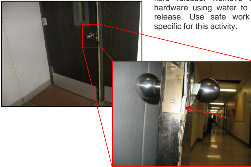
Fire door interior (white sheets of asbestos)

Precautions: There is a potential for fibre release. Remove the door or hardware using water to control fibre release. Use safe work procedures specific for this activity.