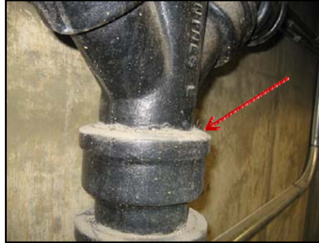
Joint packing on a cast iron pipe

Precautions: Do not disturb or cut into the packing. If repair or maintenance work may cause disturbance of this material, contact your supervisor.