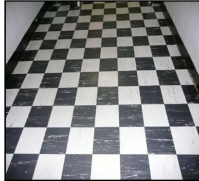
Vinyl asbestos tile (VAT)

Precautions: Do not cut or break dry tiles. Only trained University staff may remove less than 10 square feet with hand tools using low risk procedures specific to this activity.