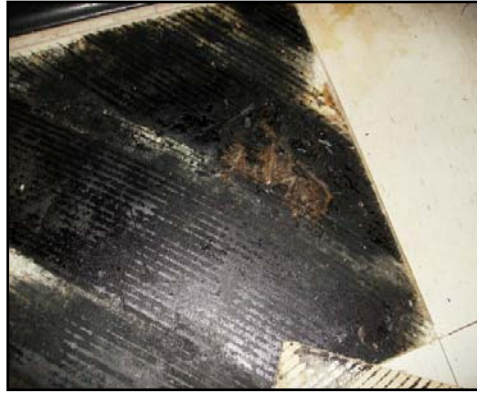
Black mastic under vinyl floor tiles

Precautions: The flooring must be checked for floor leveling compound prior to removal of the flooring. This applies to carpet and floor tile removal. Sometimes FLC may be present under mastic or paint. If repair or maintenance work may cause disturbance of this material, contact your supervisor.