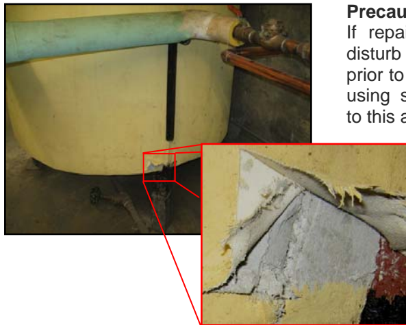
Parging cement on a tank

Parging cement is also found on tanks, vessels, boilers, etc. as either a layer between canvas and felt/fibreglass or as a thicker layer on wire lathe and covered with canvas. It contains 5% to 90% Chrysotile asbestos.