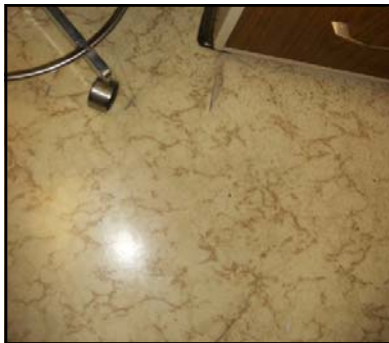
Sheet vinyl flooring