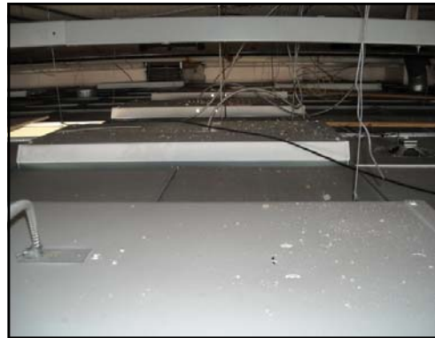
Texture coat debris on ceiling tiles & light fixtures

Precautions: Use extreme care when lifting ceiling tiles that may have ACM debris. Use low-risk safe work procedures specific to accessing ceiling spaces that may contain ACM.