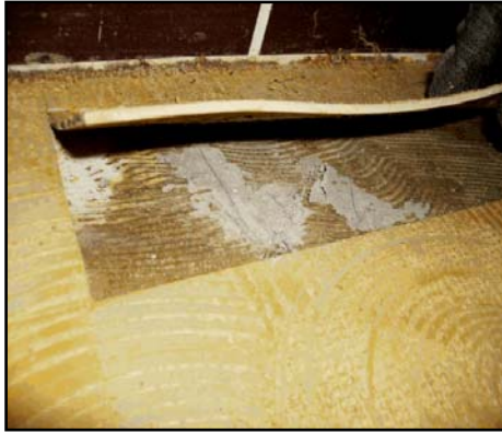
Grey FLC under floor tiles