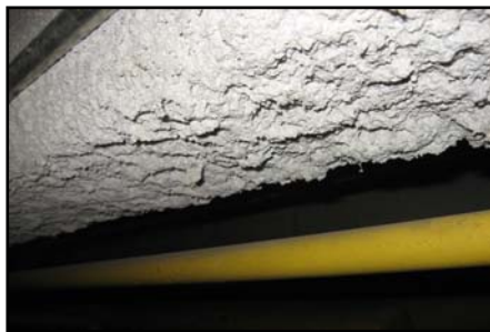
Spray-applied thermal insulation (fireproofing)

Spray-applied thermal/acoustic insulation is generally found in mechanical rooms and sometimes above suspended ceilings, on beams, metal decks, joists and columns. This type of insulation may contain 1% to 90% Chrysotile or Amosite asbestos and is very friable. Most asbestos containing spray-applied fireproofing insulation on campus has been removed or replaced with non-asbestos materials. If in doubt, request to have a sample taken for clarification.