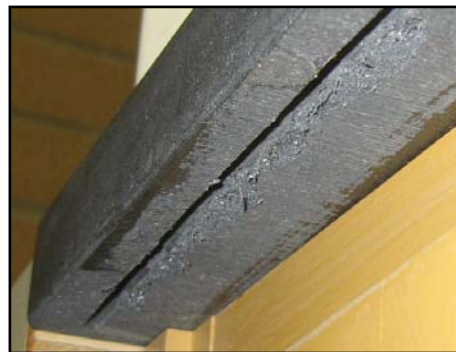
Underside of countertop

Precautions: Do not cut under dry conditions. Attach or remove under controlled conditions using specific low-risk safe work procedures.