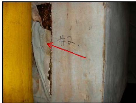
Parging cement on duct

Precautions: Do not disturb material. If repair or maintenance work may disturb the ACM; it must be removed prior to the repair and/or maintenance using safe work procedures specific to this activity.