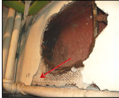
Beige "scratch coat" plaster

Asbestos may be present in all layers of plaster but is typically found in the coarse "base" or "scratch coat" layer of plaster (beige or grey in color) typically on metal or wood lathe. The asbestos content has generally been found to be 1% to 5% Chrysotile and/or Actinolite asbestos. Asbestos containing dust may be generated during wall repair or demolition.