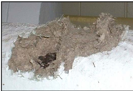
Brown solid fibrous insulation

Asbestos containing construction paper is sometimes found on pipe runs covering layers of felt and fibreglass and wrapped with canvas. It typically contains 1% to 5% Chrysotile asbestos.