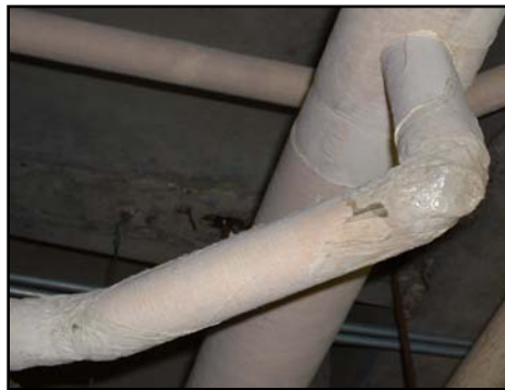
Pipe elbow mud wrapped with non-painted

Pipe fitting insulation or “mud” includes a mixture of asbestos and cement on pipe elbows, joints, valves, reducers, hangers, etc. The mud is usually found wrapped with painted or non-painted canvas, but occasionally as bare mud. Mud may also be found applied on joints as a thin layer over fibreglass insulation and wrapped with canvas. This type of material usually contains 5% to 90% Chrysotile asbestos. It may occasionally be mixed with Amosite or Crocidolite.