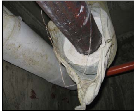
White solid block insulation

Precautions: Do not disturb material. If repair or maintenance work may disturb the ACM; it must be removed prior to the repair and/or maintenance using safe work procedures specific to this activity.