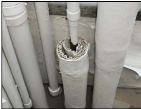
Corrugated “Aircell” insulation

Besides asbestos mud, there are other types of asbestos containing materials used to insulate pipes throughout University buildings including corrugated “Aircell” insulation, construction paper, solid fibrous insulation and solid block insulation.