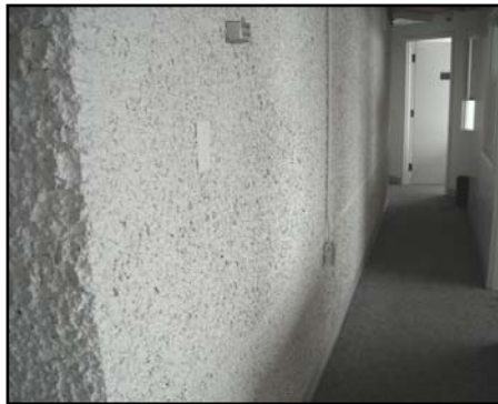
Decorative plaster (spray-applied)

Decorative plaster or "cement plaster" is mixed with cement and is either spray-applied or troweled. The asbestos content has generally been found to be 1% to 5% Chrysotile asbestos. Asbestos containing dust may be generated during wall repair or demolition.