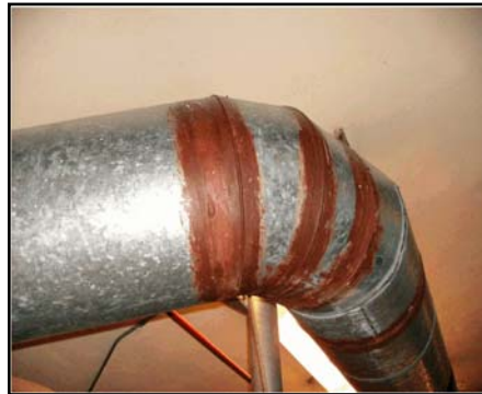
Red duct mastic

Precautions: Do not cut into the mastic. The most effective way to abate this material is to wrap the mastic, cut the duct on either side of the mastic and dispose of the whole piece of duct with the mastic as asbestos waste.