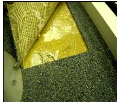
White FLC under carpet

Mastic may also be present under VAT. It contains 1% to 10% Chrysotile asbestos. It is non-friable.