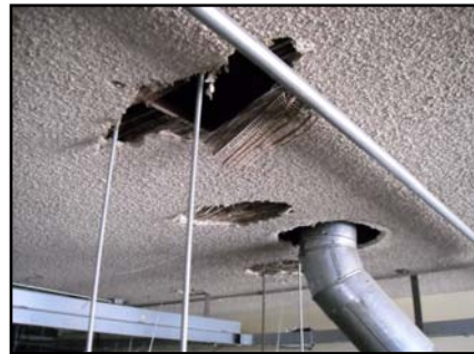
Ceiling texture coat