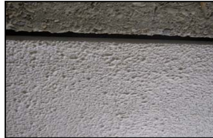
Ceiling stipple coat

Precautions: Do not disturb this material under dry conditions. Small penetrations and attachments can be done under wet conditions using safe work procedures specific to this activity. If a drill is used, it must have a dust collection device fitted with a HEPA filter.