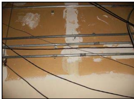
Drywall joint compound

Drywall joint compound is often present along drywall seams, over screws, over steel corner beads and sometimes as a thin layer on the drywall. The asbestos content in joint compounds has generally been found to be 1% to 10% Chrysotile asbestos. Asbestos containing dust may be generated during wall repair or demolition.