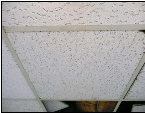
T-Bar ceiling tile

T-Bar ceiling tiles may contain 1% to 25% Chrysotile or Amosite asbestos. Asbestos ceiling tiles range from a wide variety of sizes including 1'x1', 2'x2', 2'x4', and 1.5'x6'. There may be asbestos and non-asbestos tiles in the same area. The only way to know for sure is by having the tiles tested. Generally, ceiling tiles with deep fissures and a red backing are more likely to contain asbestos. The majority of asbestos containing ceiling tiles have been removed from campus and replaced with non-asbestos materials.