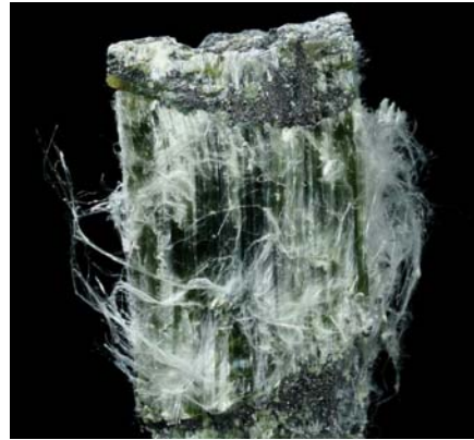
Chrysotile asbestos (mineral form)

Asbestos is a naturally occurring, strong mineral fibre that is resistant to heat and many chemicals. It differs from other minerals because of its fibrous, crystalline structure that can be separated into flexible fibres.