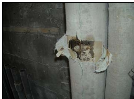
White construction paper insulation

Precautions: Do not disturb material. If repair or maintenance work may disturb the ACM; it must be removed prior to the repair and/or maintenance using safe work procedures specific to this activity.