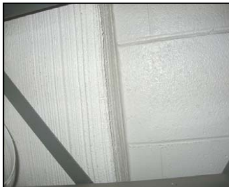
Decorative plaster (troweled)

Decorative plaster or "cement plaster" is mixed with cement and is either spray-applied or troweled. The asbestos content has generally been found to be 1% to 5% Chrysotile asbestos. Asbestos containing dust may be generated during wall repair or demolition.