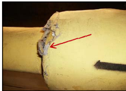
Mud on fibreglass adjacent to valve

Precautions: Do not disturb material. If repair or maintenance work may disturb the ACM; it must be removed prior to the repair and/or maintenance using safe work procedures specific to this activity.