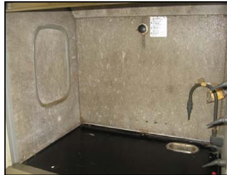
Transite fume hood lining

Cement board or “Transite” is a mixture of cement and asbestos. Due to its high resistance to heat and corrosion, cement board has been used in a wide range of applications. Examples include fume hood linings, flammable and chemical storage cabinets, roof and siding panels, perimeter heat register panels and wall and ceiling panels. It has been found to contain 5% to 90% Chrysotile asbestos. The material may also be painted.